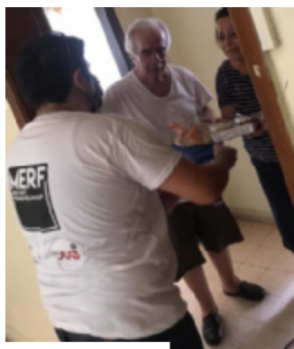
Aid to the elderly

injuries when the explosion shattered glass and mangled door and windows frames. Now it has become central to MERF's Beirut Explosion Disaster Diaconal Relief Response. Here hearts are being touched by the Word of God. Many have visited since the explosion. All had the opportunity to hear the Gospel. As we pray with them and give practical help, they also are delighted to know many others are praying for them.