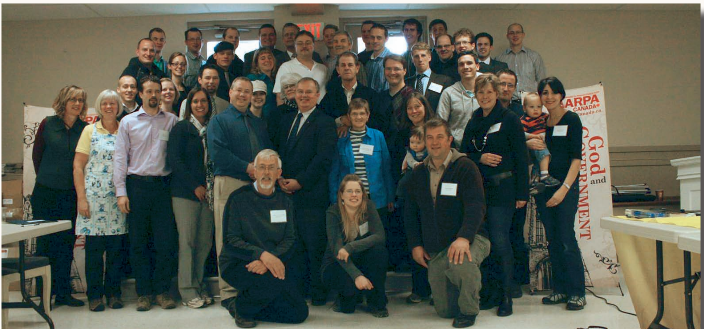
ARPA reps from 16 of the 19 chapters who made the trek to Ottawa